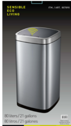
Costco Item# 807890