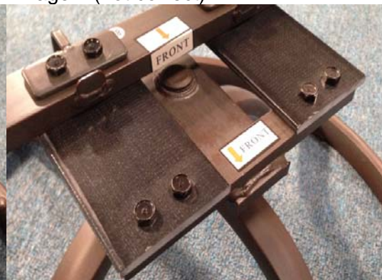
...Without the protective metal plates